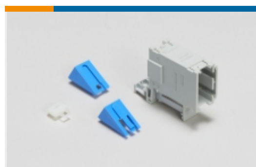
Rectangular Connector Adapters(4)